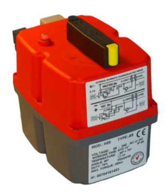
The all new J3 - H20

Visual indication of the actuator's operating status is constantly shown by a highly visible LED light.