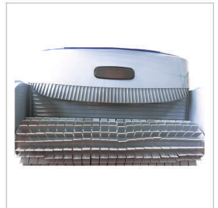
360° roller brush