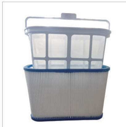
Double filtration- filter basket plus cartridge